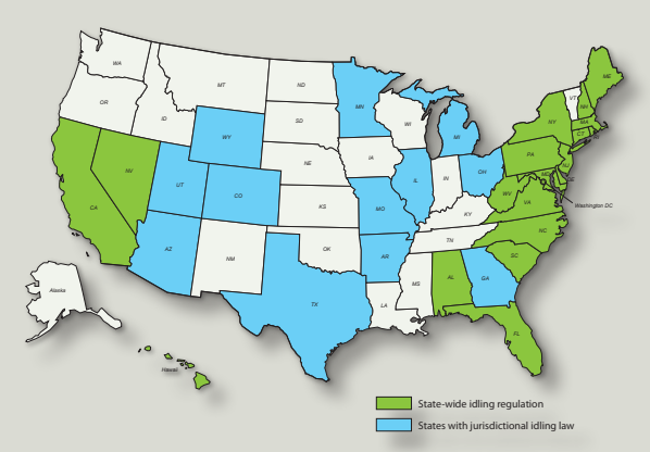
Figure 5. States with idling regulations.

Idling is more than a matter of emissions and wasted fuel; states, counties, and cities are passing laws to limit the amount of time vehicles of all types may idle (Figure 5). Passenger vehicles are increasingly the target of these laws.