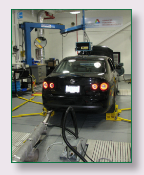
Figure 1. A 2009 VW Jetta TDI undergoing testing at Argonne's Advanced Powertrain Research Facility.

The first car to be instrumented was a 2009 VW Jetta TDI (Figure 1), which is a 50-state compliant, Tier 2 Bin 5 vehicle with a complex aftertreatment system that includes a diesel oxidation catalyst (DOC), a particulate trap, and a nitrogen oxide (NO_x) trap. The engine controller was monitored to record engine speed, coolant temperature, and vehicle speed. In addition, thermocouples were placed before and after the aftertreatment devices. Because of the lack of an available temperature chamber, we relied on ambient conditions. A 2010 Ford Focus was instrumented in the spring; low-temperature measurements will be taken on this vehicle later this year. Measurements on several additional vehicles, including some light trucks, are also planned.