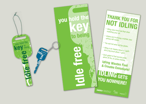
Figure 4. Argonne is developing educational materials for an idling reduction campaign.

Idling is more than a matter of emissions and wasted fuel; states, counties, and cities are passing laws to limit the amount of time vehicles of all types may idle (Figure 5). Passenger vehicles are increasingly the target of these laws.